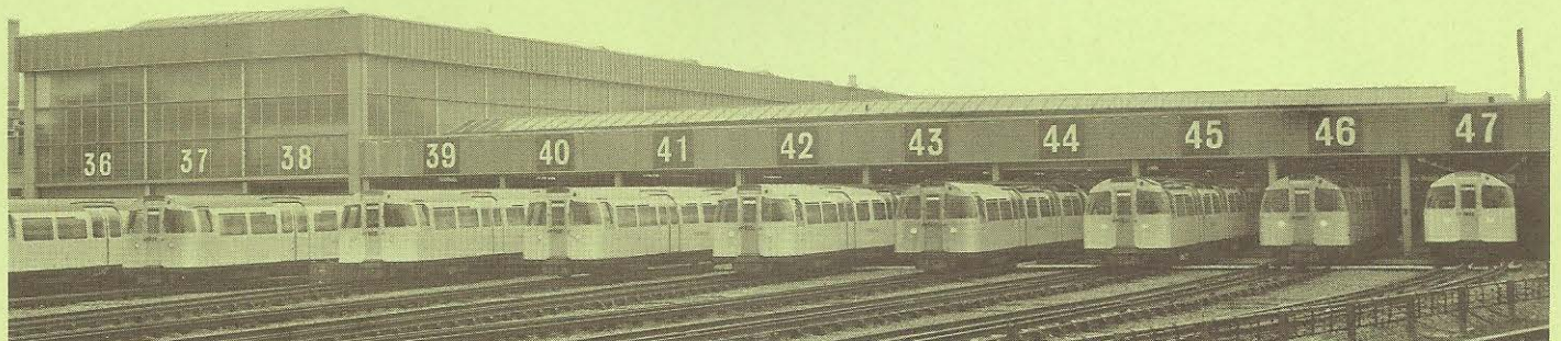
Victoria Line tube stock at Northumberland Park Depot.