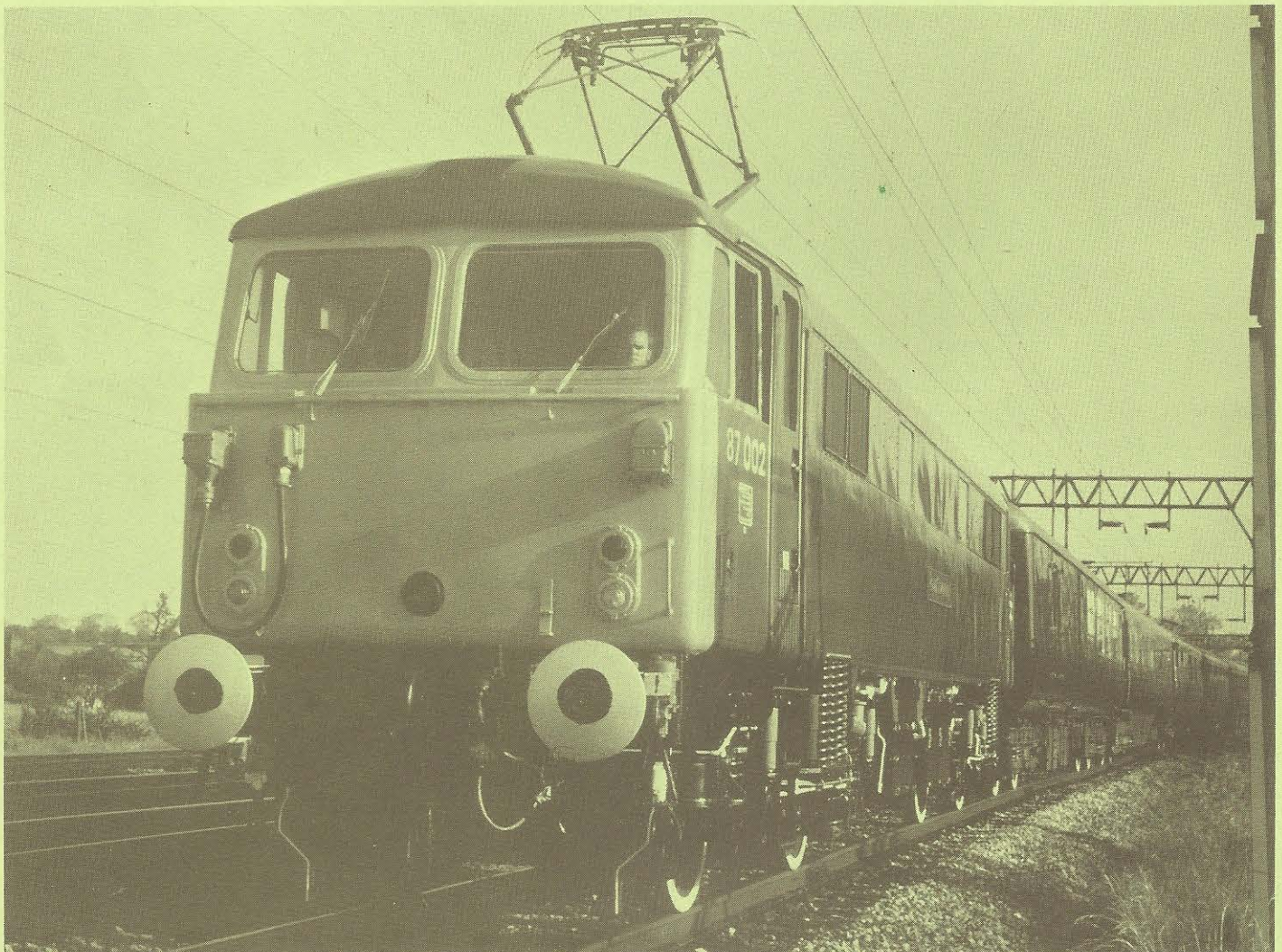
British Rail Class 87 ac locomotive